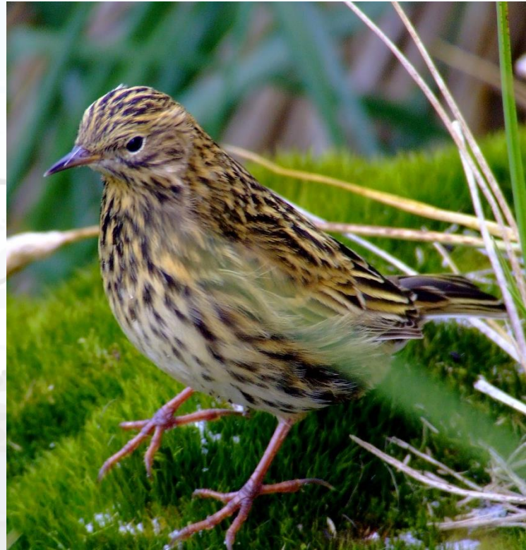
South Georgia pipit