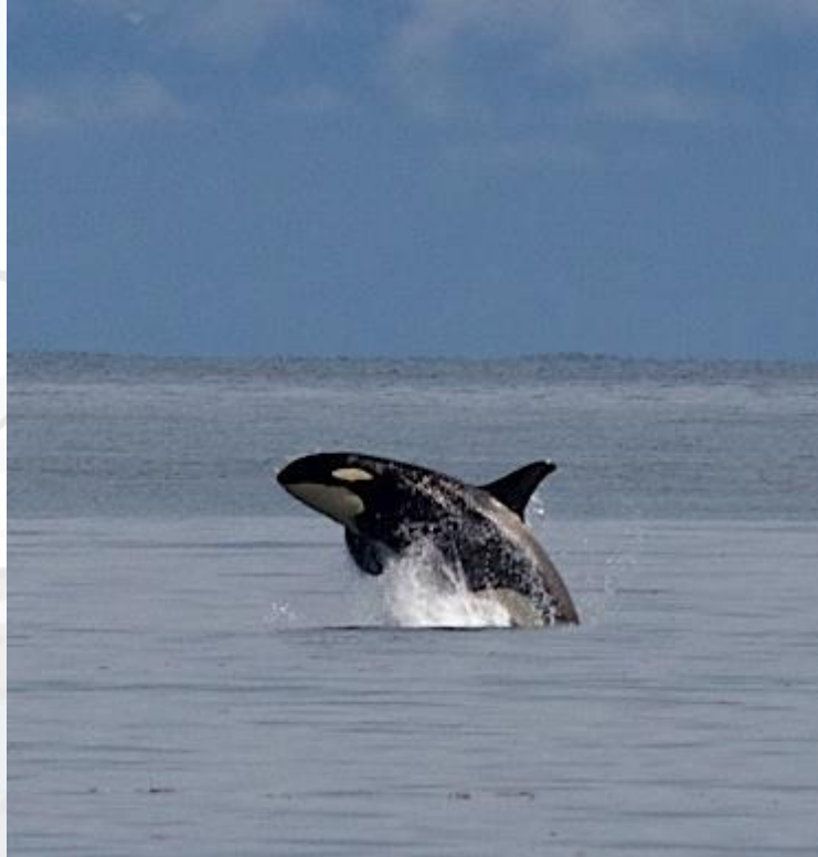
orca (killer whale)