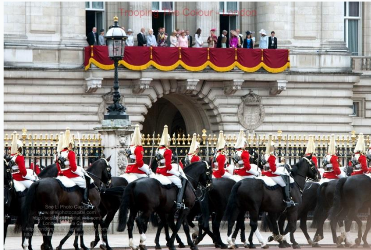
The Trooping of the Colour

On her official birthday, Her Majesty is joined by other members of the Royal Family at the spectacular Trooping the Colour parade which moves between Buckingham Palace, The Mall and Horseguards' Parade as well as a public appearance on the balcony of Buckingham Palace.