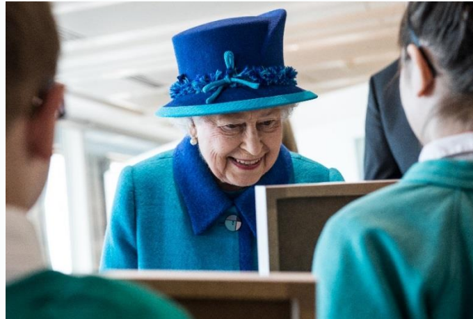
The Birthday Honours

The list of Birthday Honours is also announced at the time of the Official Birthday celebrations. The Queen's Birthday Honours recognise the achievements of a wide range of extraordinary people across the UK with awards such as knighthoods, OBEs (Officer of the Most Excellent Order of the British Empire) and MBEs (Member of the Most Excellent Order of the British Empire).